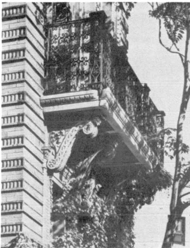
The terra-cotta quoins and window frames are seen here near the small balcony on the east side of the house.